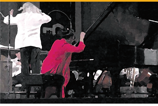
Above: Windows of the World Production at Redlands Bowl

Distinguished Artist Award, Artists International, NY